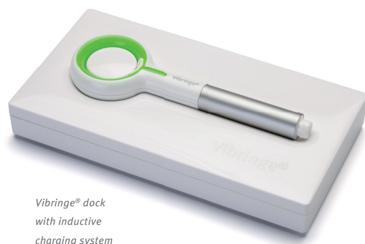
Vibringe® dock with inductive charging system